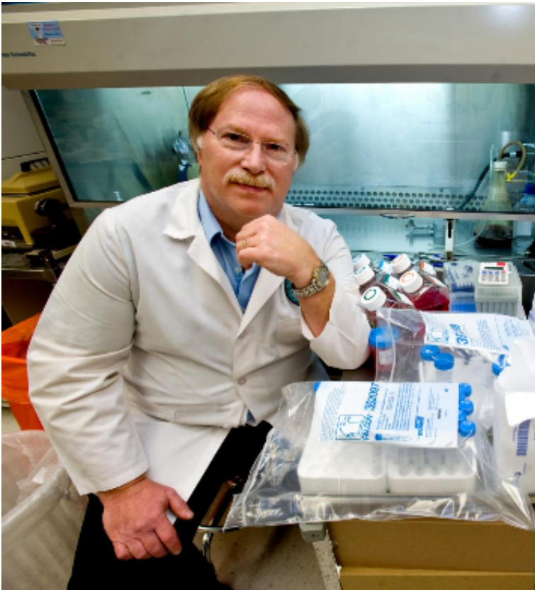
Stalwart at Tulane (since 1983) , founded

Zalgen labs (which has profited hugely from Covid).