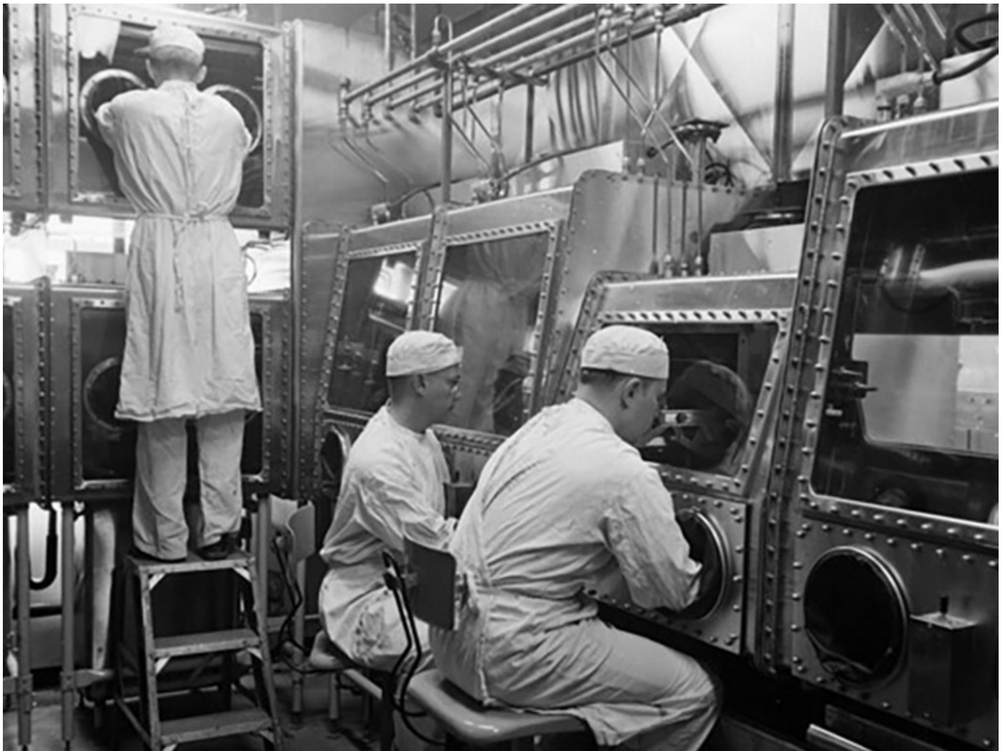
Scientists at Fort Detrick, ca. 1946.