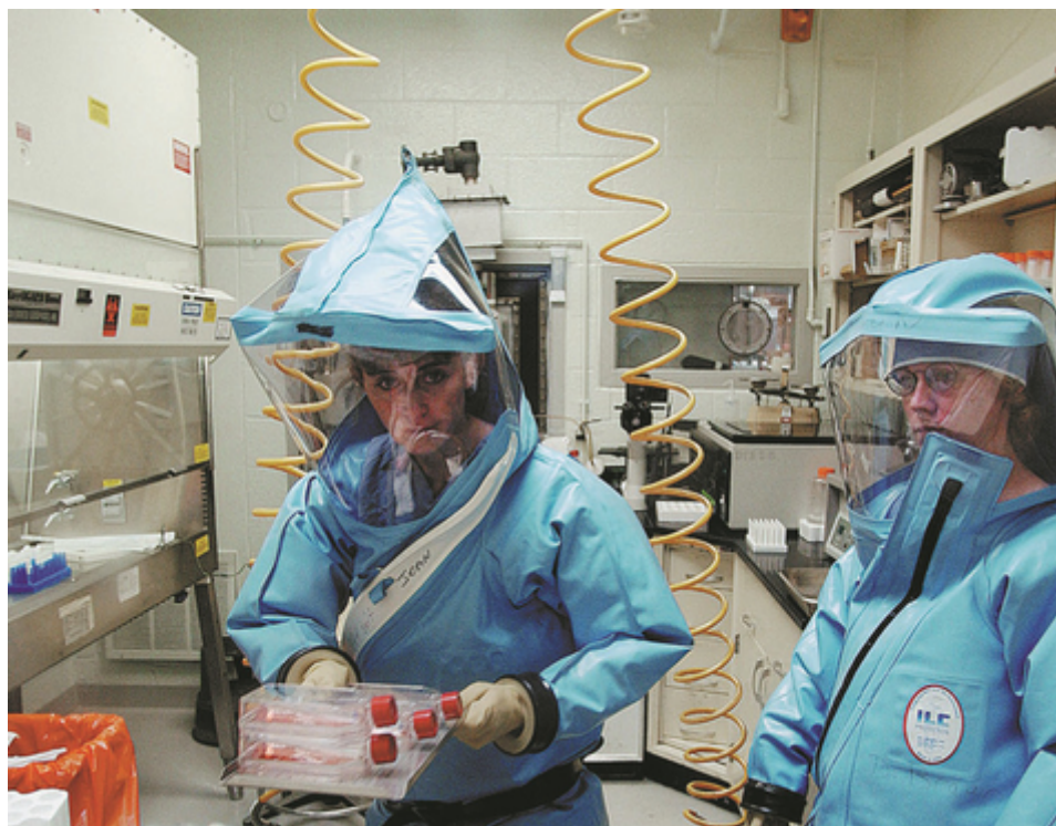
Fort Detrick personnel, 2002