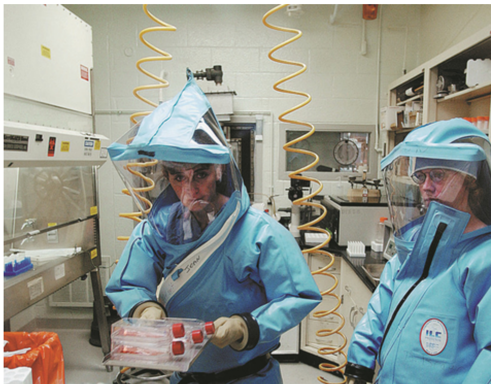
Fort Detrick personnel, 2002