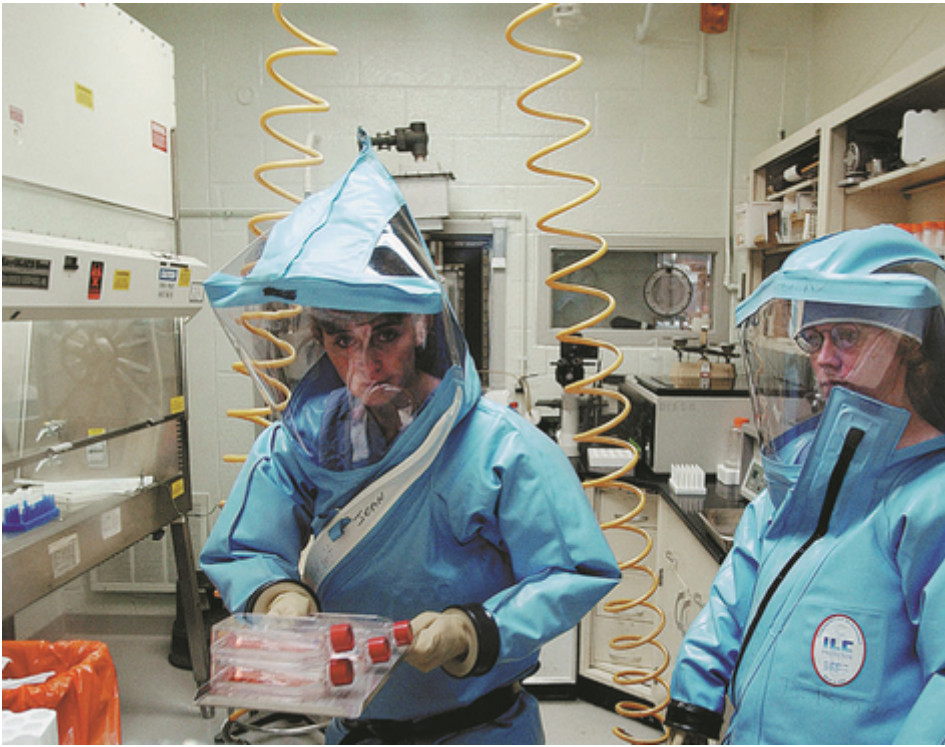
Fort Detrick personnel, 2002